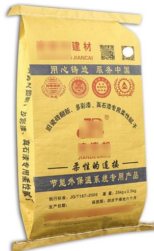
SX-VTP Paper Valve Bag Traditional