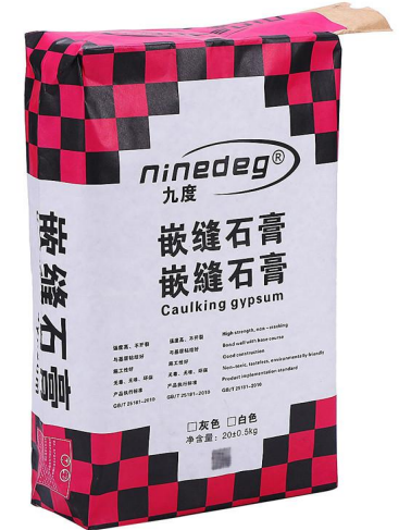
SX-VPO Paper Valve Bag Outer Valve Opening