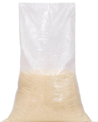
SX-PA 100% Virgin PP Material Transparent Color