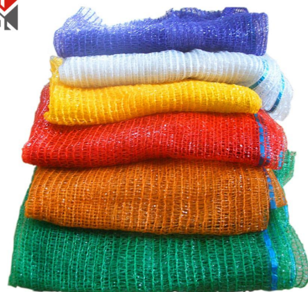
SX-OT-002 Mesh Bag