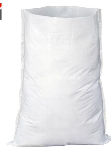
SX-PC-002 Laminated PP Material White Color