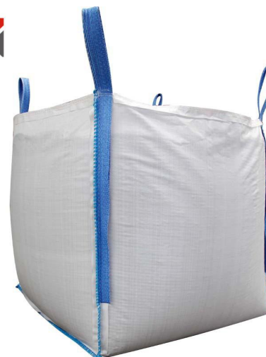
SX-OT-003 Jumbo Bag