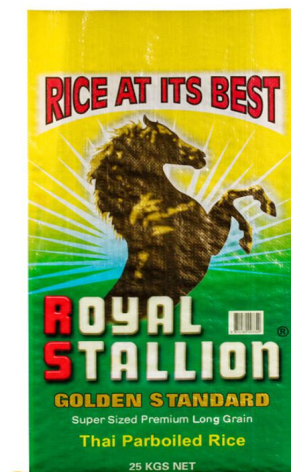
SX-PC-007 BOPP Printing