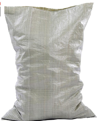
SX-PD Recycled PP Material Grey White