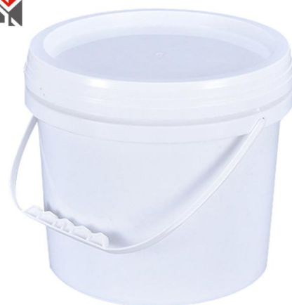
SX-OT-009 White Color Round