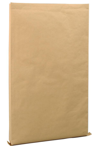
SX-ZP-003 Compounded Paper Bag 1 Layer PP + 1 Layer Paper