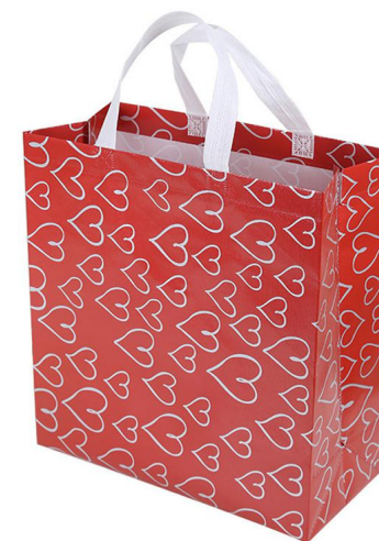
SX-OT-004 PP Nonwoven Bag