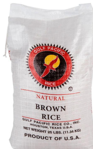
SX-PC-003 Offset Printing