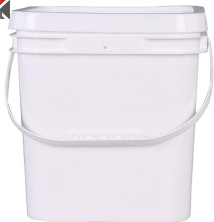
SX-OT-009 White Color Square