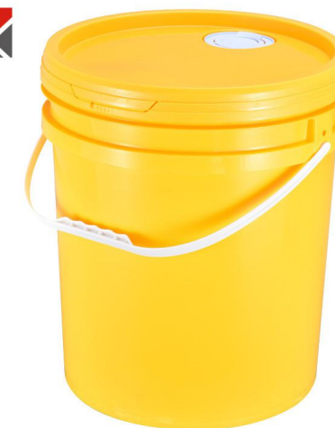
SX-OT-009 Optional Color Square / Round