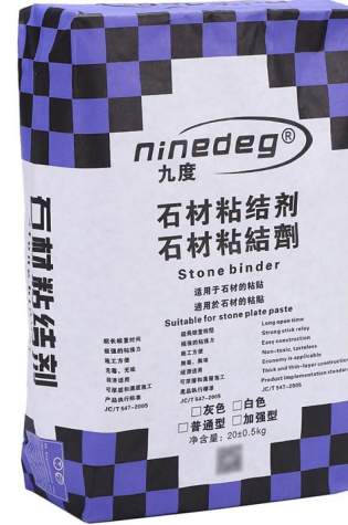
SX-VPI Paper Valve Bag Inner Valve Opening