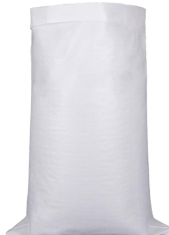
SX-PC 85% Virgin PP Material White Color