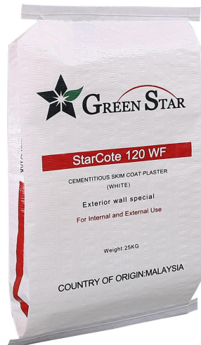
SX-VT PP Valve Bag Traditional