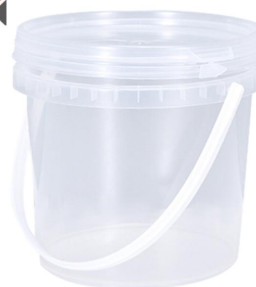
SX-OT-009 Transparent Color Square / Round