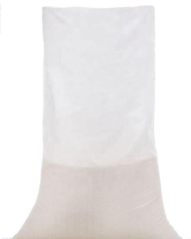
SX-PB 95% Virgin PP Material White Color