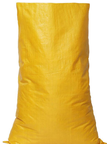
SX-PJ Colorful PP Material Optional Color