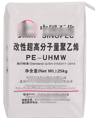
SX-VO PP Valve Bag Outer Valve Opening