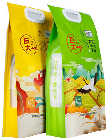
SX-OT-001 PE Bag