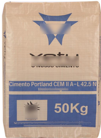
SX-VI PP Valve Bag Inner Valve Opening